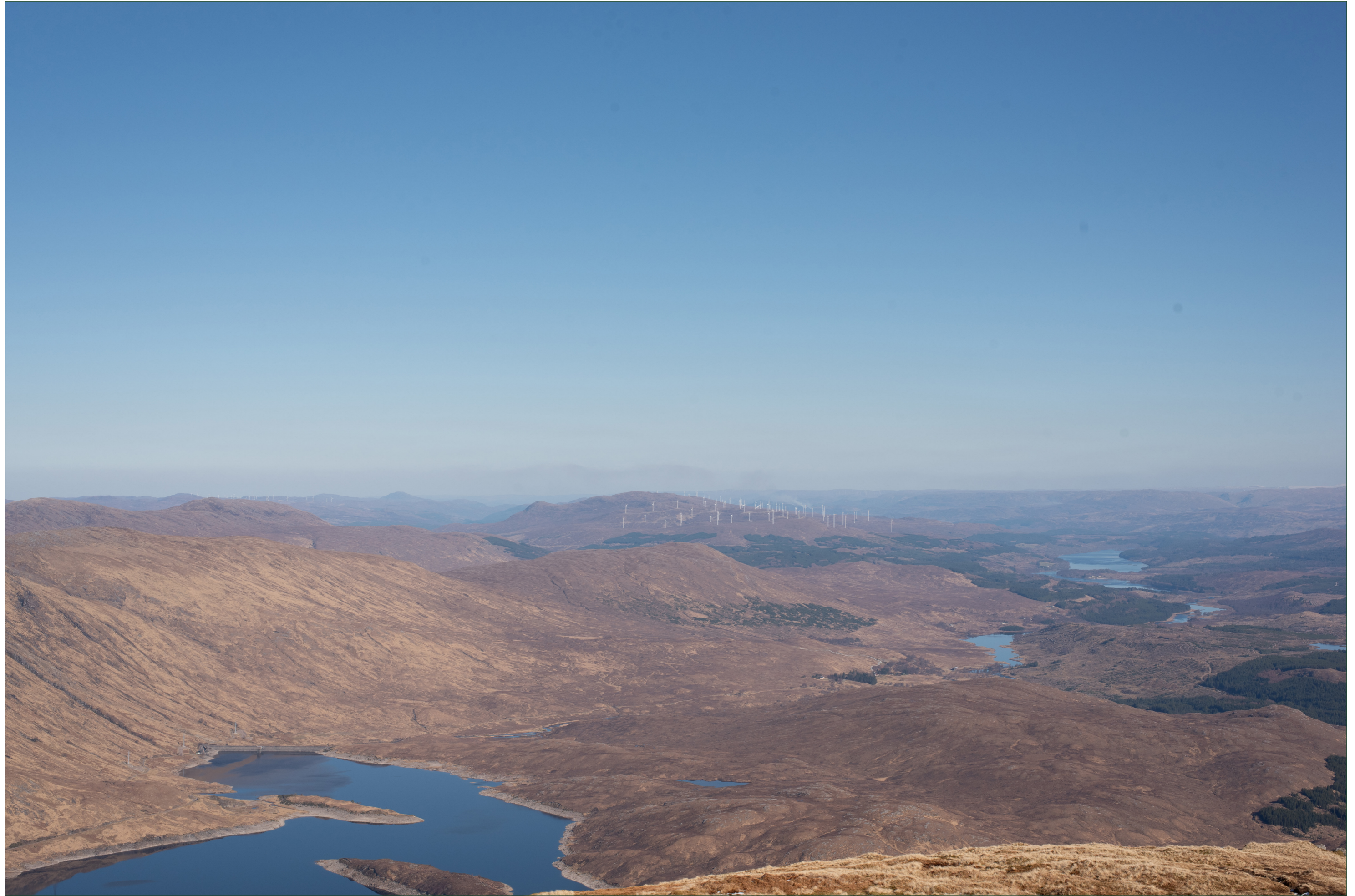
Viewpoint 11: Gairich

Distance to nearest turbine: 18367m Camera: Nikon D750 Focal length: 50mm Camera height: 1.5m AGL Date: 18/03/2025 Time: 14:20