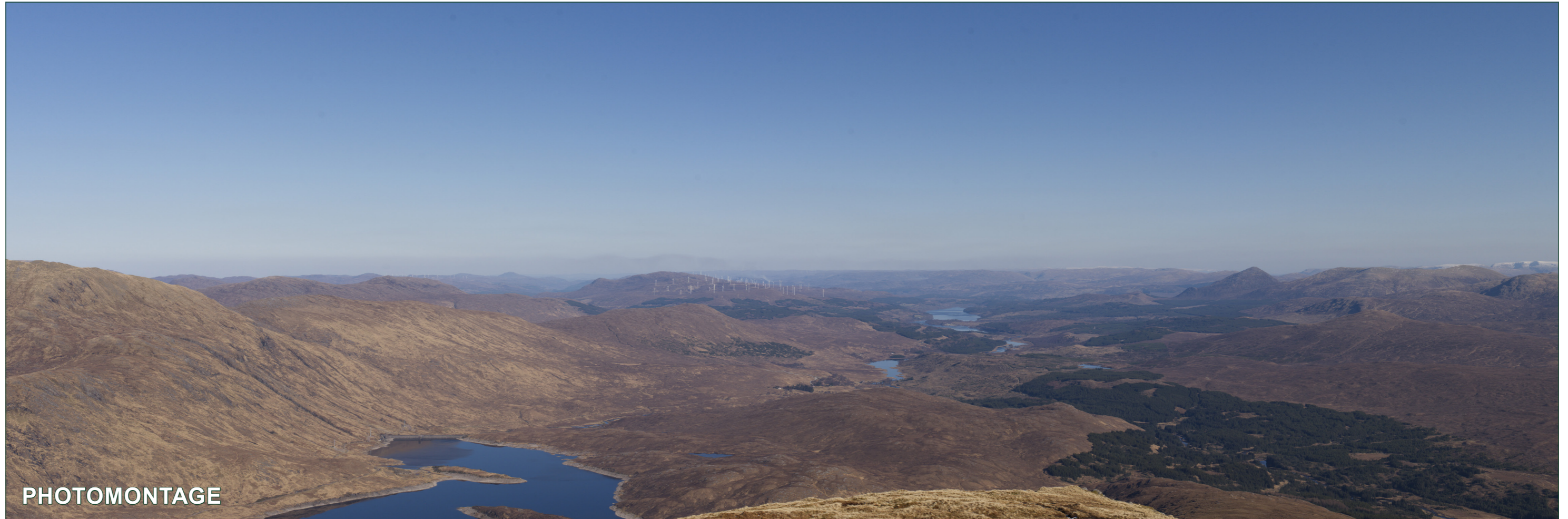
Viewpoint 11: Gairich

Distance to nearest turbine: 18367m Camera: Nikon D750 Focal length: 50mm vertical (27°) x 28mm horizontal (65.5°) Camera height: 1.5m AGL Date: 18/03/2025 Time: 14:20